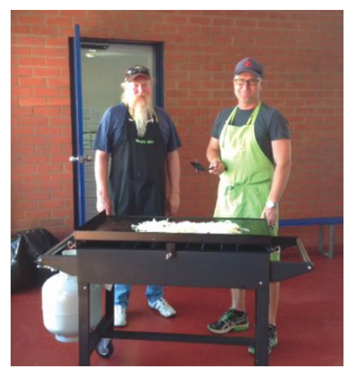
Helpful dads cooking up a storm

Note: All grant applications are assessed by an independent review panel against set criteria.