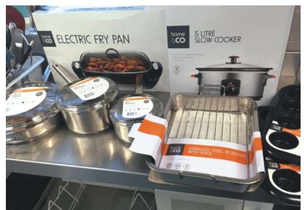
Neerigen Brook Primary School's new equipment