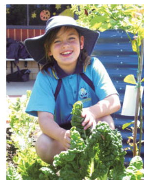
Pictured, Comet Bay Primary School

Helps get kids' hands dirty and learn how to grow, harvest, prepare and share fresh, seasonal food. Schools joining the program commit to building the necessary infrastructure, attending and delivering the program within the Stephanie Alexander Kitchen Garden Foundation philosophy. Visit: www.kitchengardenfoundation.org.au/